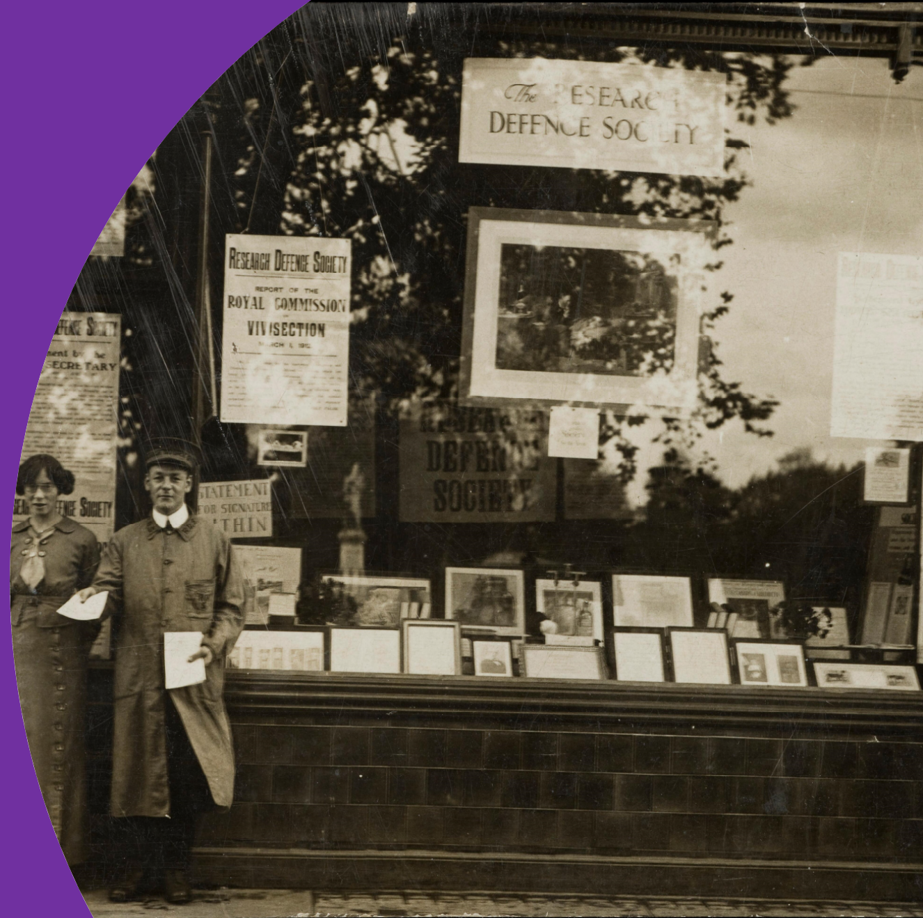
Research Defence Society Shop Front, c.1912